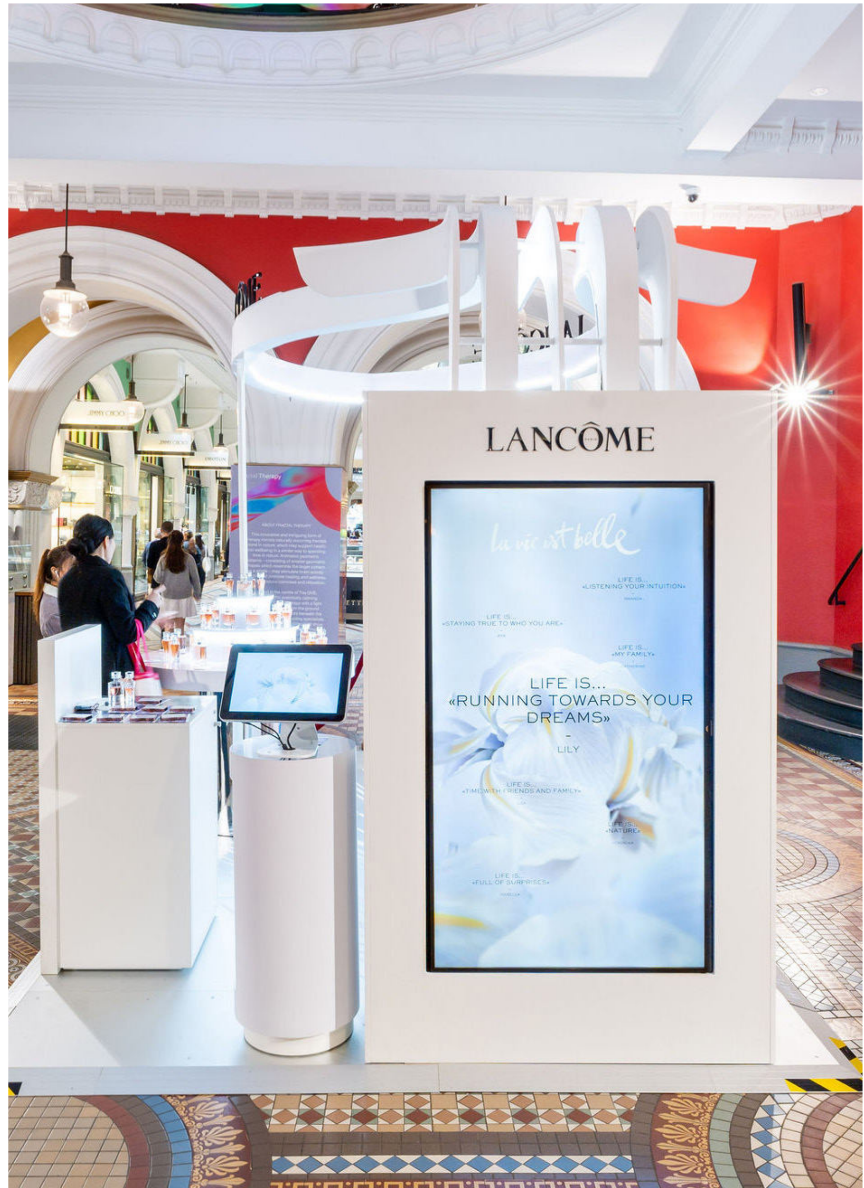
RETAIL & POS DISPLAY SOLUTIONS