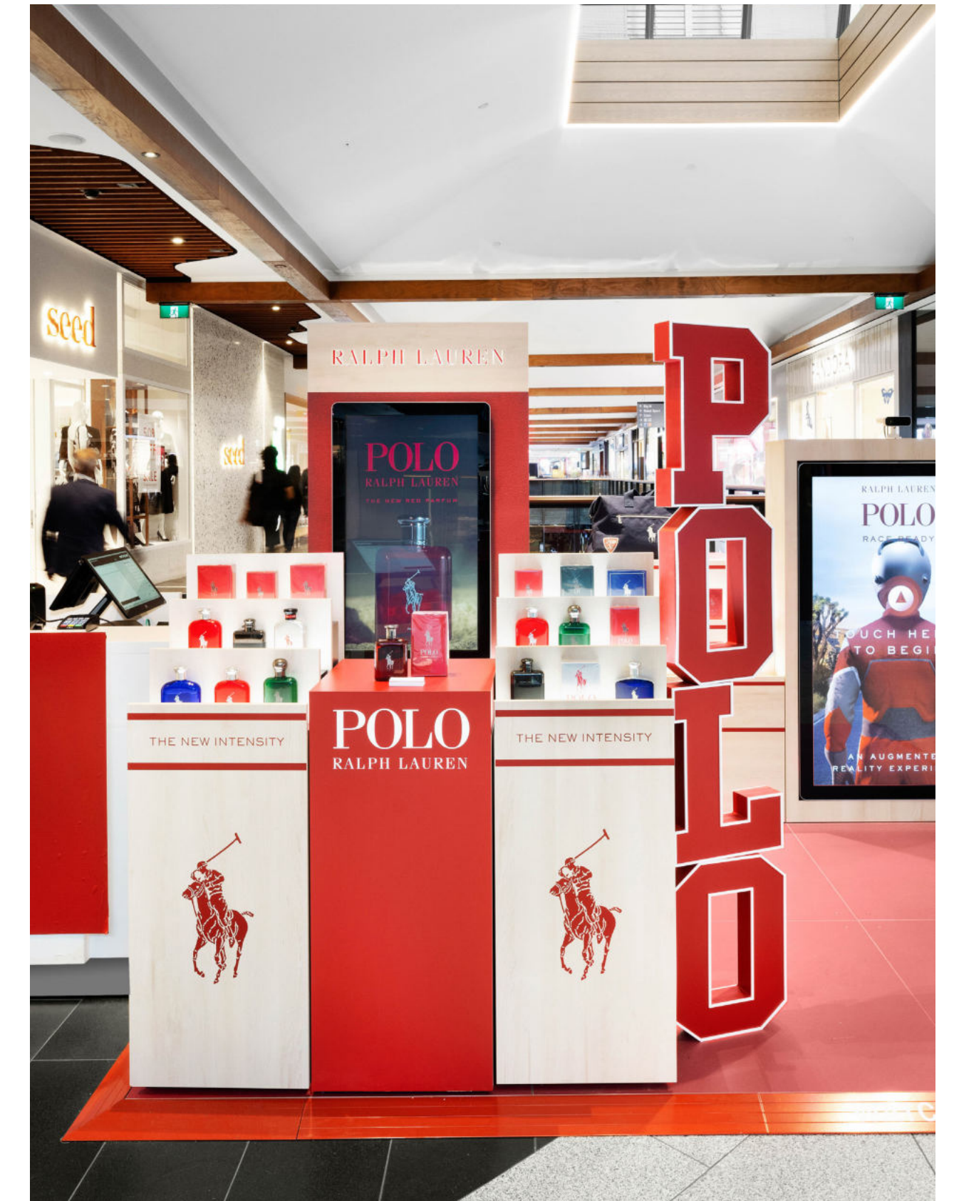
RETAIL & POS DISPLAY SOLUTIONS

Our national installation capability and trusted partner network ensures your retail display or point of sale units are delivered to multiple sites seamlessly, without the need for you to engage additional suppliers or contractors.