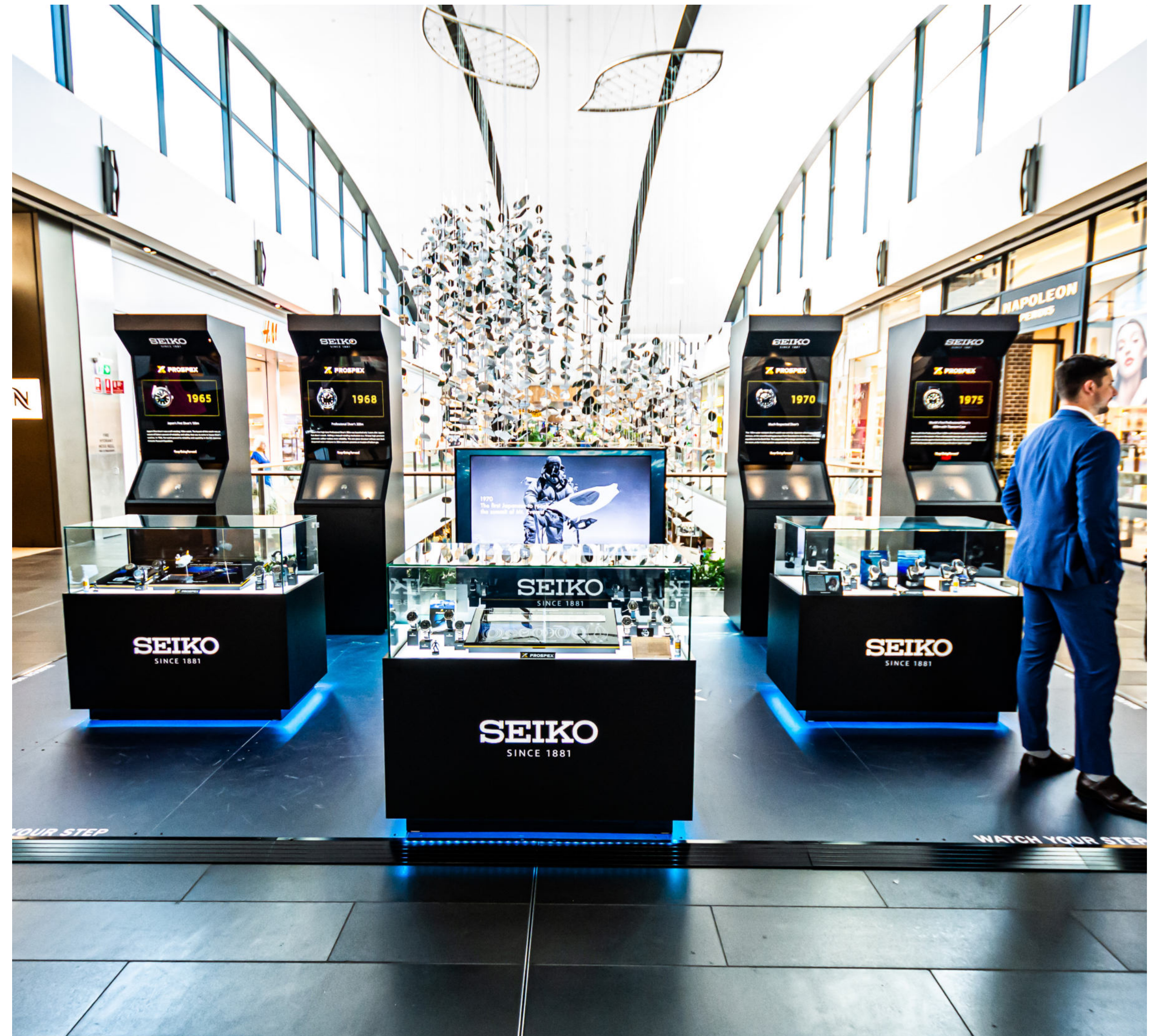
RETAIL & POS DISPLAY SOLUTIONS