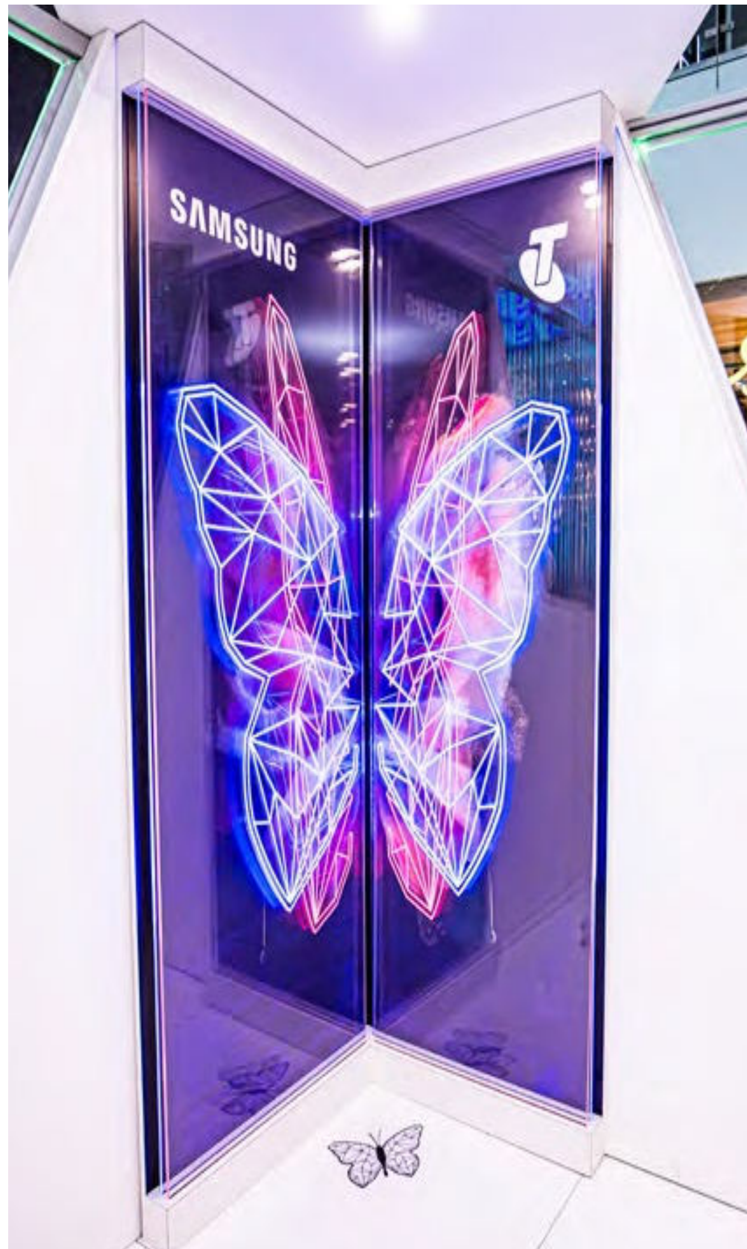
RETAIL & POS DISPLAY SOLUTIONS