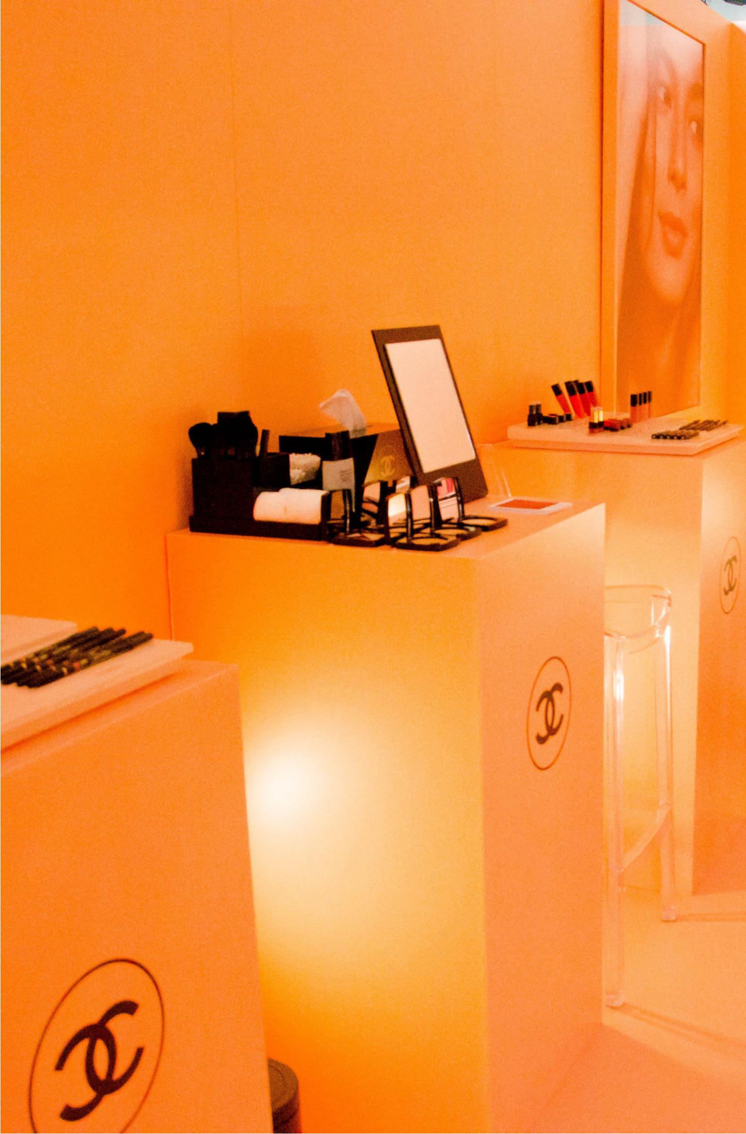
RETAIL & POS DISPLAY SOLUTIONS