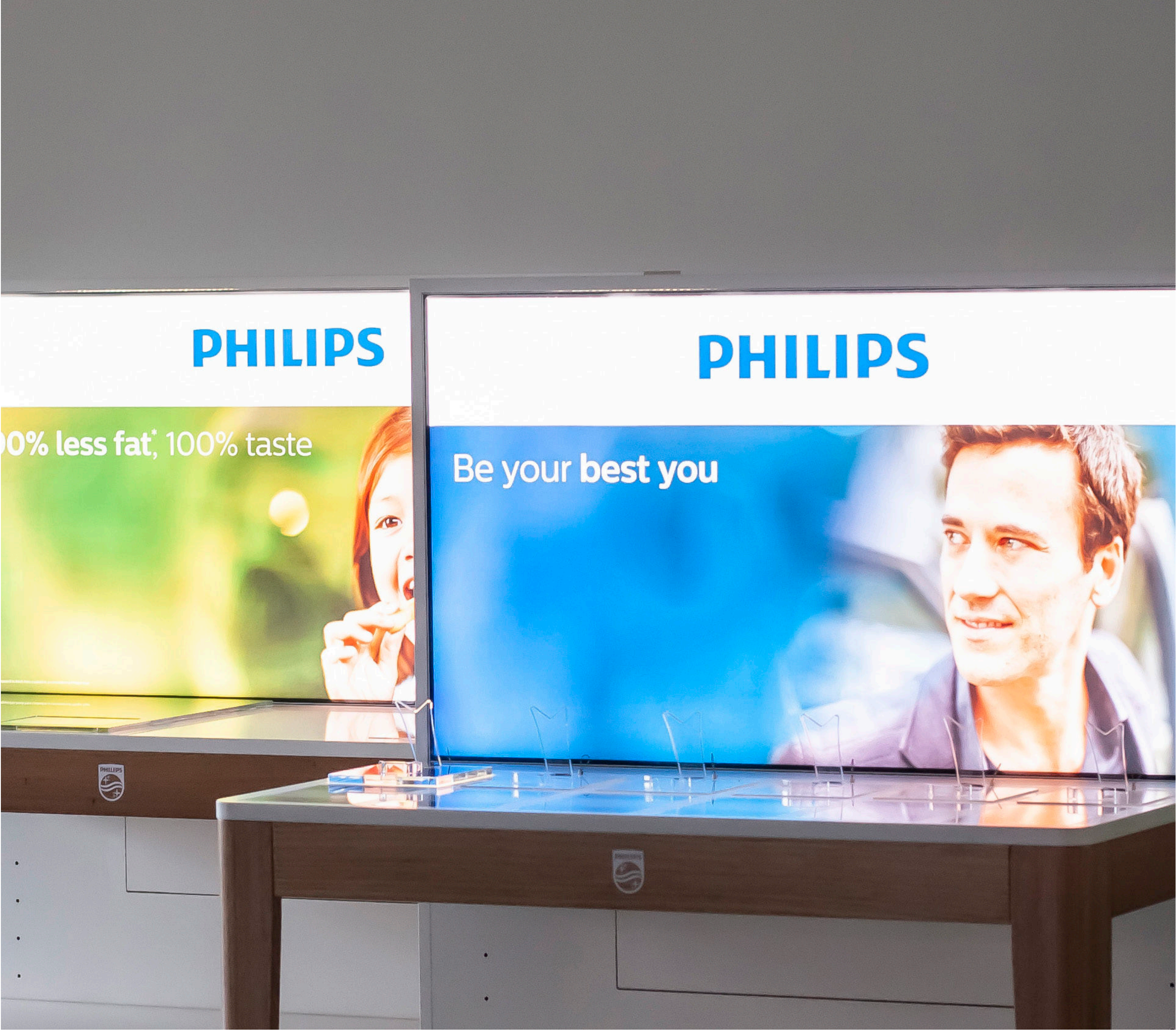
RETAIL & POS DISPLAY SOLUTIONS